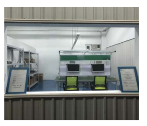
Sea-Air Logistics provides four separate clean rooms for clients' product reworks, testing, and firmware updates.

Sea-Air's integrated logistics services include product inspection, model verification, quantity count, sort, pick, and pack; reworks; product bundling; repairs; firmware updates; reverse logistics; postponement; spare parts banks; and more. Each month top distributors collect orders that Sea-Air prepares on behalf of its clients from its complex in Hong Kong in sizes ranging from a pallet to multiple containers. Sea-Air picks, packs, and PGI's (post goods issues) each client's order when it's collected from the company's facility. Further, it stores and manages each client's inventory and provides weekly cycle counts and a year-end perpetual inventory. The company's logistics team is thoroughly trained on most enterprise resource planning software platforms including